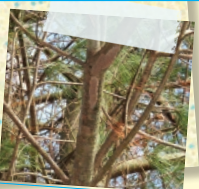
Spotted lanternfly egg mass on underside of pine branch.