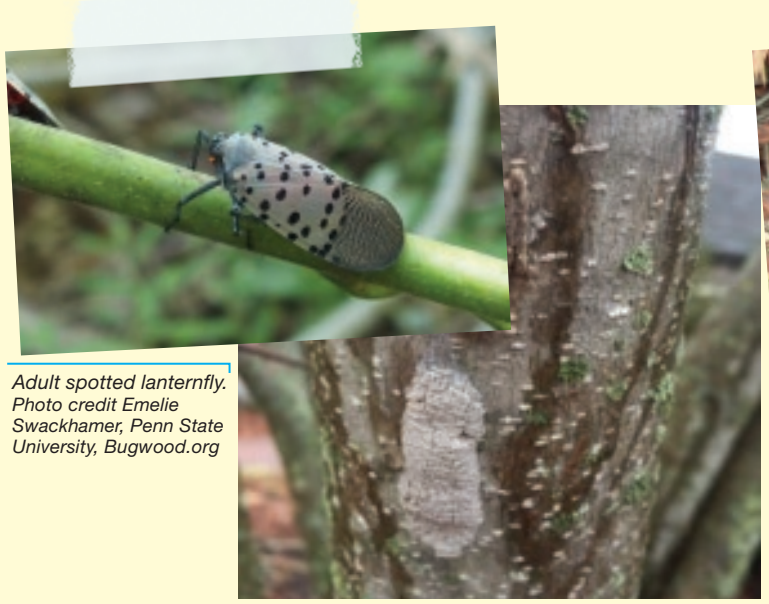
Spotted lanternfly egg mass.

Growers, dealers, and shippers should be aware holiday greenery such as cut Christmas trees, wreaths and boughs and potted Christmas trees are considered regulated articles under the Federal Gypsy Moth Quarantine and must be certified for movement outside of the area regulated. Gypsy moth, like spotted lanternfly, can be transported long distances by an egg mass deposited in a protected location on a tree or vehicle. Spruce, fir and Douglas-fir are especially high risk for transporting gypsy moth egg masses because the gypsy moth can complete its life cycle entirely on those species. If you ship holiday greenery out of the gypsy moth regulated area,