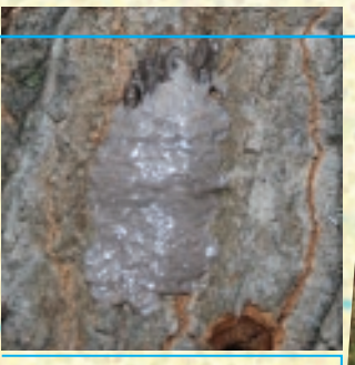
Spotted lanternfly egg mass.

In the past two years, industry and regulators in the Great Lakes Region detected elongate hemlock scale (EHS) in several shipments of wreaths and cut Christmas trees. EHS is an invasive insect pest originally introduced into the United States from Asia. While EHS is usually associated with hemlock, it feeds on other conifers, including spruce and fir. EHS damages trees by feeding on the sap of its host through piercing mouthparts, which extract nutrients from the trees and weakens the tree. EHS has mixed distribution in the Great Lakes Region, so those in the industry need to make sure they do not move it to new areas.