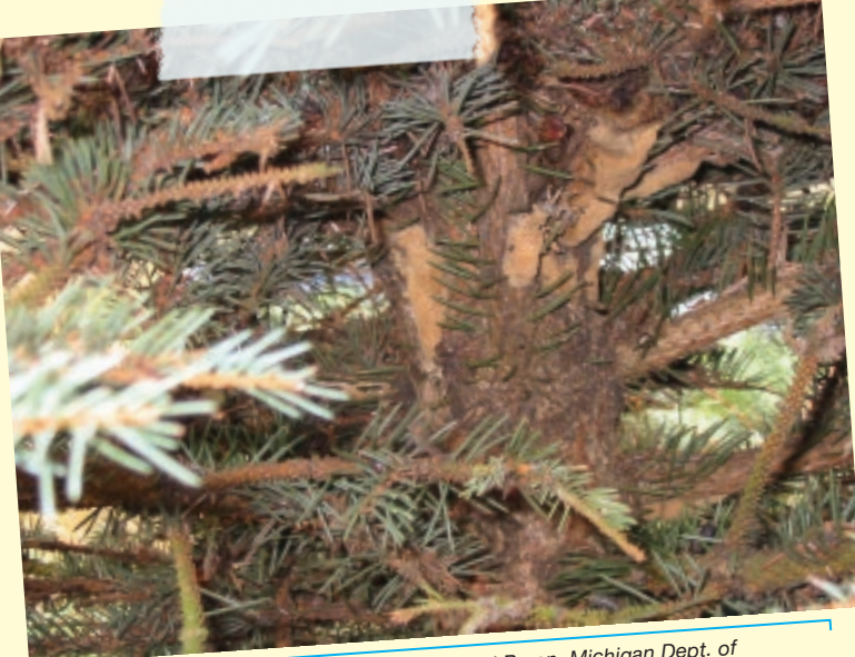
Gypsy moth egg masses.