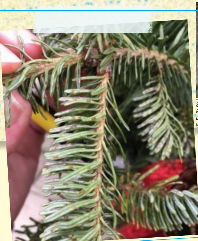
Elongate hemlock scale on Fraser fir.

make sure you have secured gypsy moth certification through your plant regulatory official. As a last-minute precaution, examine the commodity as it is being loaded or unloaded. Gypsy moth egg masses can be laid near the base of Christmas trees on the underside of branches.