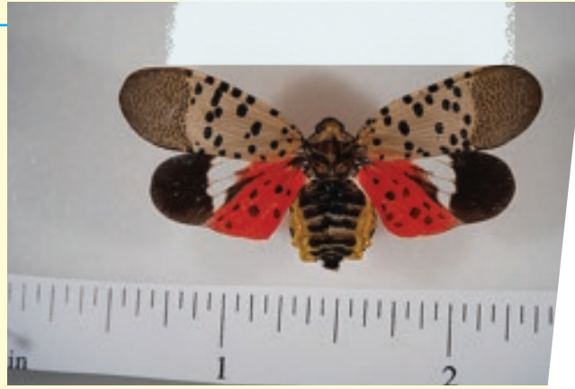
Adult spotted lanternfly.